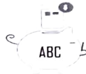
Transfer of Credits