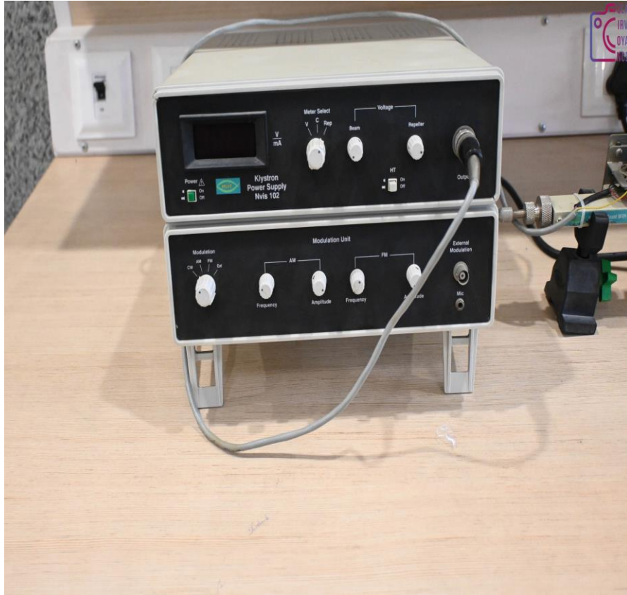
KLYSTRON POWER SUPPLY