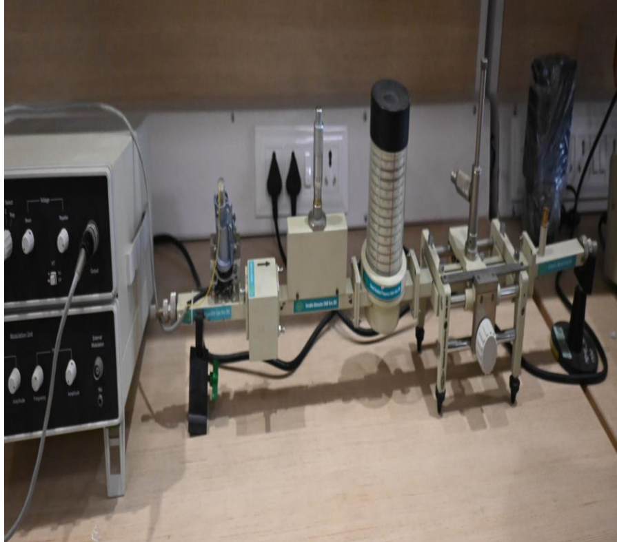
GUNN PIN Based Microwave Testbench

आर एफ और माइक्रोवेव लैब | RF & MICROWAVE LAB