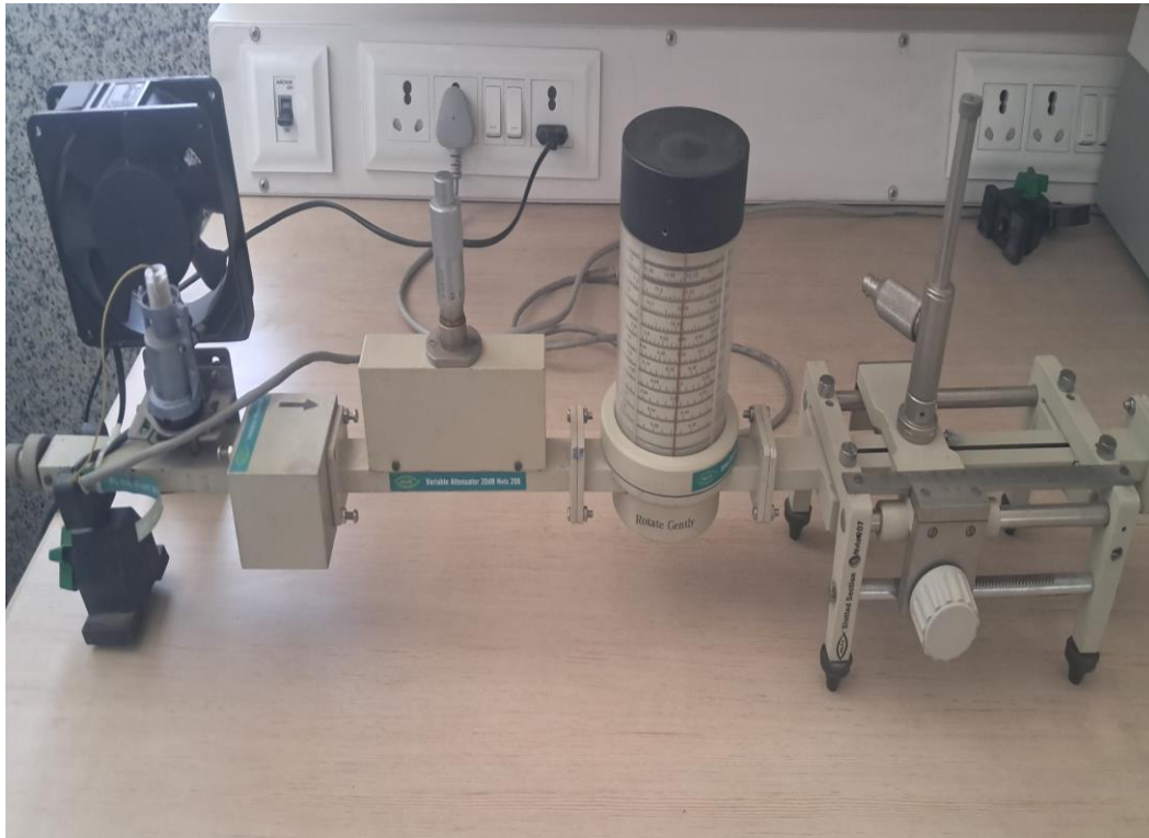
Reflex Klystron Based Microwave Testbench

आर एफ और माइक्रोवेव लैब | RF & MICROWAVE LAB