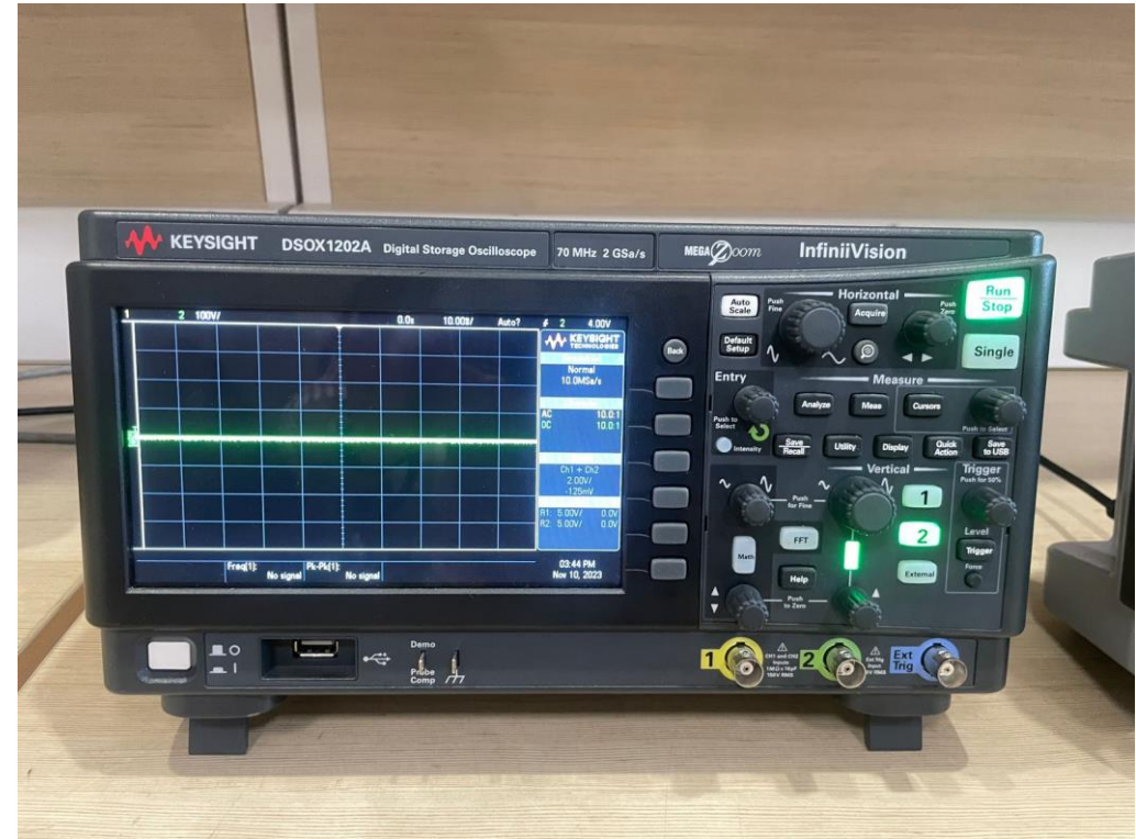
DSO KEYSIGHT DSOX1202A, 70 MHz, 2 Channel