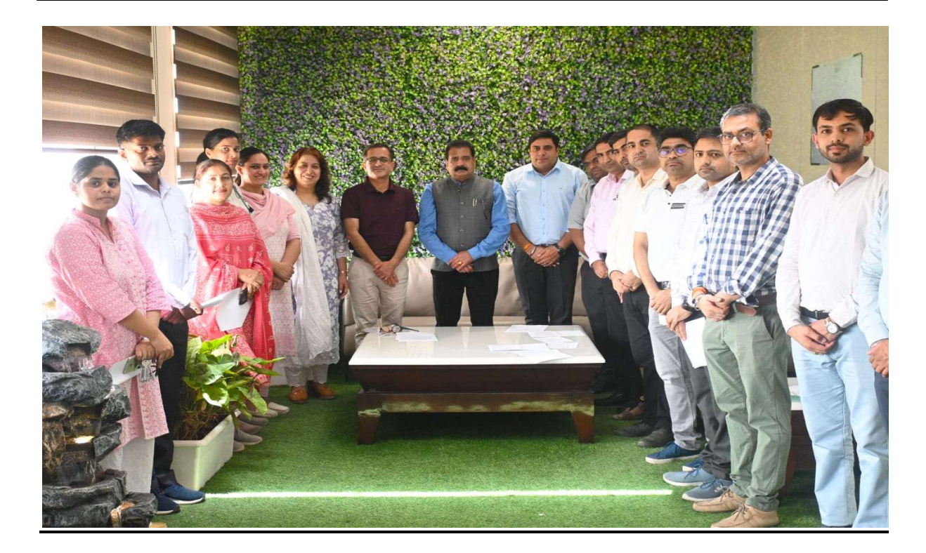
Inauguration of Environmental Microbiology Laboratory

জালে কাৰ্বনাল (15,।৫९९१) - 110056, ।৫९९१/ Piot No. FA7,20ne P1, G1 Karnai Road, Deini-110056 शिक्षामंत्रालय, भारतसरकारकेअधीनएकराष्ट्रीय महत्वकासंस्थान/ An Institute of National Importance under Ministry of Education, Govt. of India Web site: <u>https://nitdelhi.ac.in/</u>